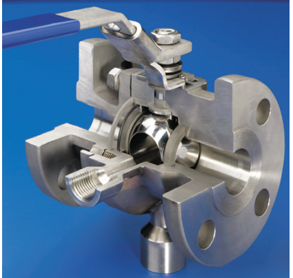
PBM's ANSI ball valve with optional purge flush ports